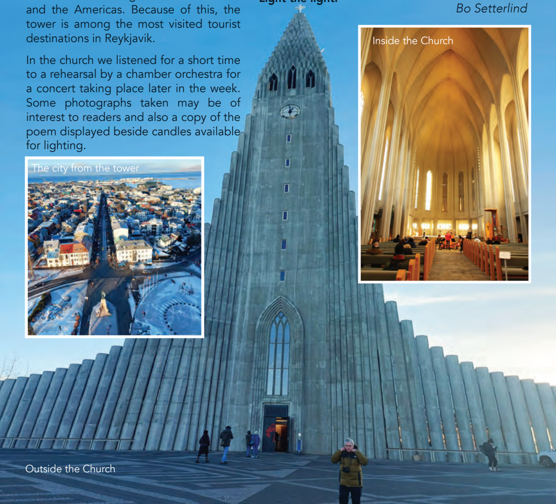
Outside the Church