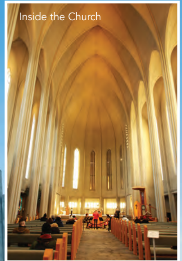
Inside the Church